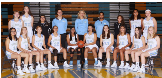
Maine West Girls Basketball Team are State Champs