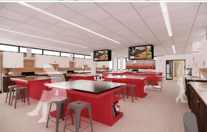
The renderings above show the Maine West entrepreneurial lab (top), the fine arts studio at Maine East (center) and the foods lab at Maine South (bottom).

While much of the country has slowed to a halt as a result of the COVID-19 pandemic, District 207 has taken the opportunity to start the construction projects earlier than anticipated since students and staff are not in the physical buildings to comply with state and federal guidelines. Rather than starting work in May, the projects moved forward in April with safety modifications to comply with Centers for Disease Control and Illinois Department of Public Health guidance.