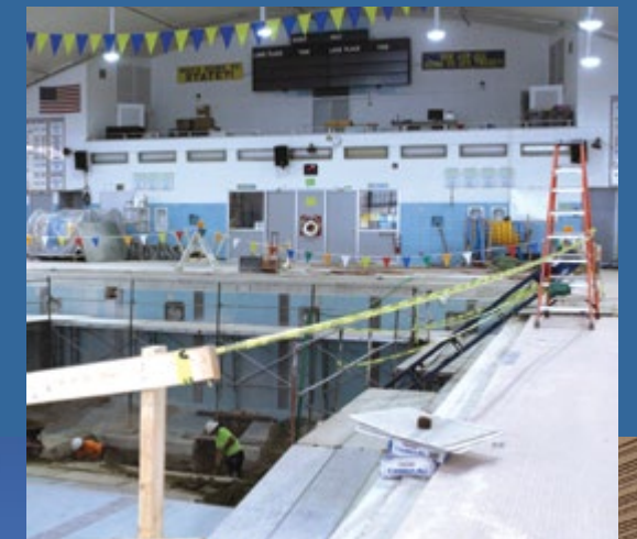
The swimming pool renovation at Maine West will deepen the pool and replace the original pool gutter system.