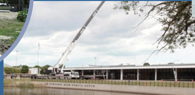
A crane delivers materials to the former courtyard as that space is converted into a new cafeteria at Maine South.