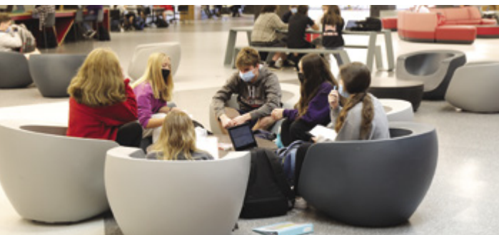
Students utilize the new student commons area at Maine South to collaborate on projects, work together and socialize during free periods.

When students arrived at school this fall, they were greeted with quite a surprise: spaces in their school buildings looked completely different and were much more conducive to learning. The goal of the ongoing construction projects at Maine East, Maine South and Maine West high schools are to improve safety and security, provide updated plumbing, electrical and mechanical systems and to create spaces for students that are more functional.