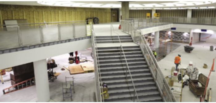
The Maine West cafeteria remodel project is scheduled to be completed in January of 2022. This is a view from the second floor of the cafeteria.