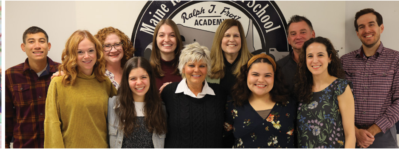
The staff at Frost Academy are dedicated to the success of their students. As one student says: "The teachers and staff are very caring and kind."