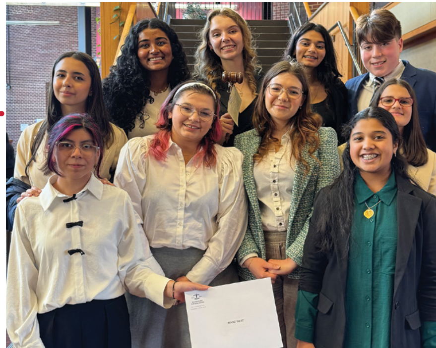
Right: Members of the Maine West Mock Trial team attend a competition with help from a MTHS Foundation grant.