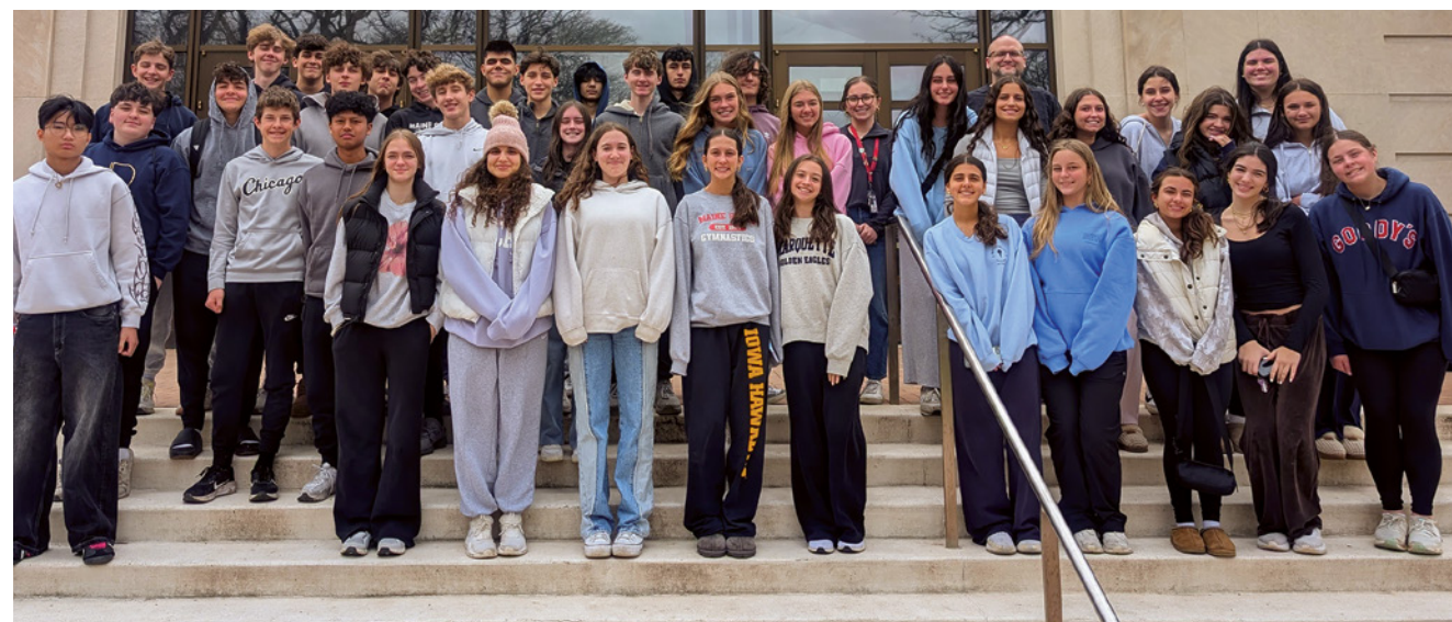
Below: Maine South U.S. History students and History Fair Team members attend a grant-supported U.S. history field trip.

trips and after school programs, we help make sure every student has what they need to thrive."