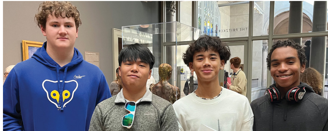
Above: District 207 students attend a field trip at the Art Institute in Chicago with the support from the MTHS Foundation.